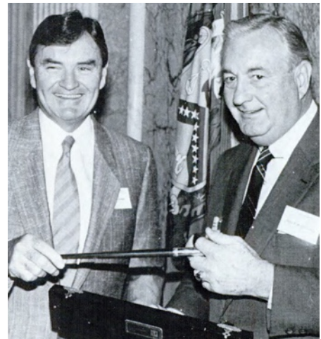
Left, in the Navy; above, 1970s or 1980s; right, passing baton at MetLife.